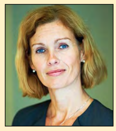
Nies: innovation is indispensable

Eurelectric therefore advocates five main actions to enhance EU innovation policy and better enable the power sector to capture existing