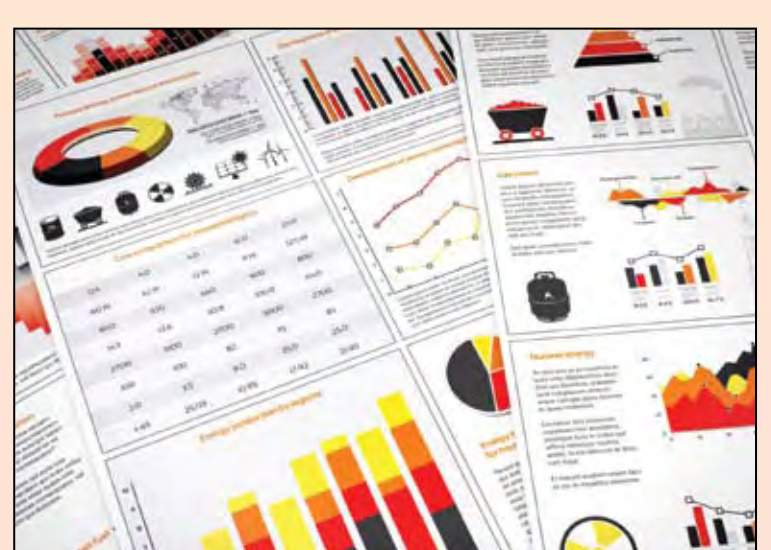
Using profile information obtained from Bsmart's metering systems, the team set up load shedding, scheduling, and central and automatic optimisation protocols

There were a number of factors affecting efficiency targets being met in each store. These included: building design – floor area and ceiling height, building fabric, glazing, insulation levels and so on; usage – heating, ventilation and refrigeration requirements, lighting levels, staffing periods and demand peaks; location – outside air temperature, humidity and wind effect; and, perhaps most significantly, staff/user-behaviour and levels of automated controls.