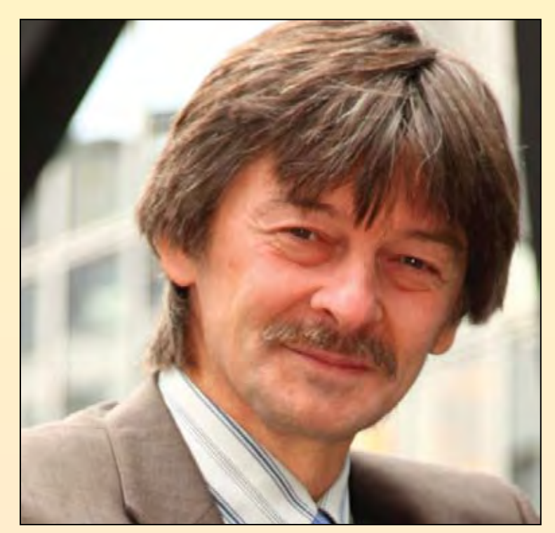
Lelaidier says there can be no meshed DC grid without a DC circuit breaker

Currently, voltage source converter technology is used to connect offshore wind farms to the onshore network as point-to-point systems. Here, DC breakers are not needed. If there is a problem, the link to the onshore network is simply disconnected. However, the situation becomes more complex when there are multiple offshore wind farms.