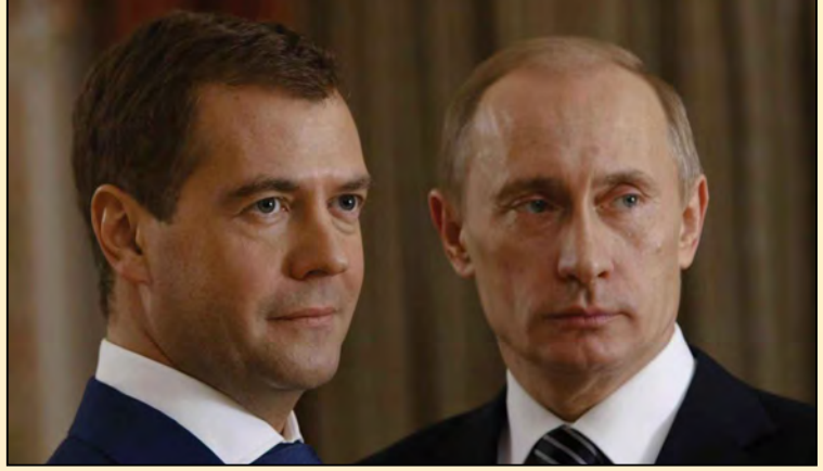
Russian President Dmitry Medvedev and Prime Minister Vladimir Putin believe nuclear energy is safe and beneficial

Ukraine, meanwhile, says that it will review its energy strategy in view of events in Japan. "We will seek a practical balance between the use of nuclear energy and the energy from the ecological sources," said Prime Minister Mykola Azarov in an interview with Austrian newspaper Der Standard . "Meanwhile nuclear power ensures half of Ukrainian needs and it is an important component of the State accommised development" the State economical development.